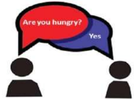
Figure 1.: Open-ended Question

2. Sometimes, when we ask a question, we expect an answer with more details. For example when we ask “What do you like to watch on TV?”, the answer could be “I like to watch movies on TV.” These are called open-ended questions because their answer options are not limited or closed.